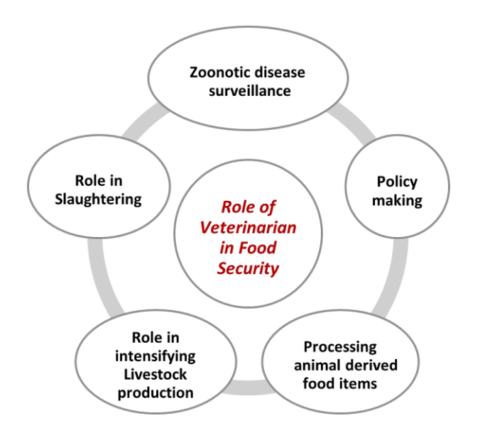
Fig. 3 The formidable role of veterinarians in ensuring global food security.